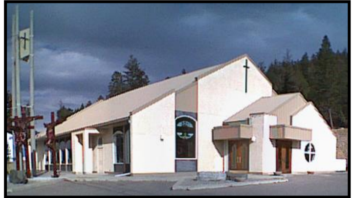
St. Joseph's Church (SJC) Hwy 93/95, Radium Hot Springs, BC