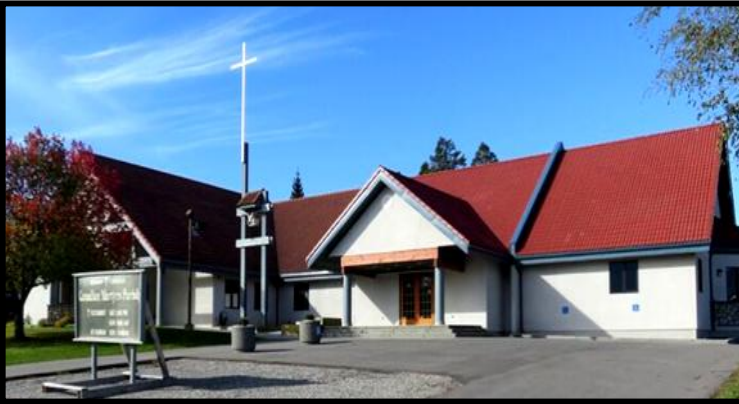
Canadian Martyrs Church (CMC) 712 - 12th Avenue, Invermere, BC