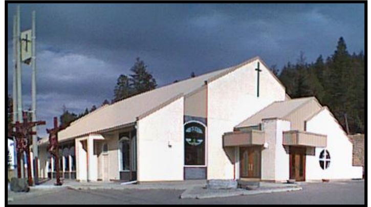
St. Joseph's Church (SJC) Hwy 93/95, Radium Hot Springs, BC