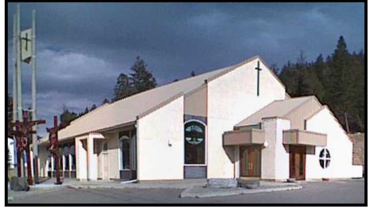
St. Joseph's Church (SJC) Hwy 93/95, Radium Hot Springs, BC