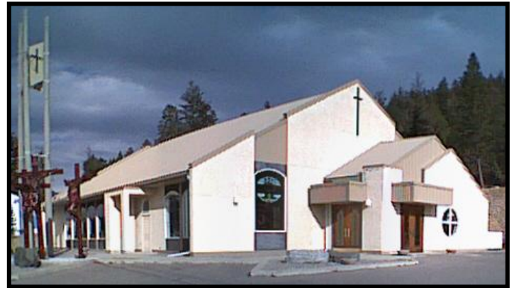
St. Joseph's Church (SJC) Hwy 93/95, Radium Hot Springs, BC