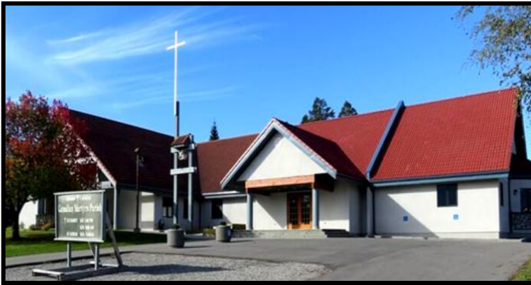
Canadian Martyrs Church (CMC) 712 - 12th Avenue, Invermere, BC