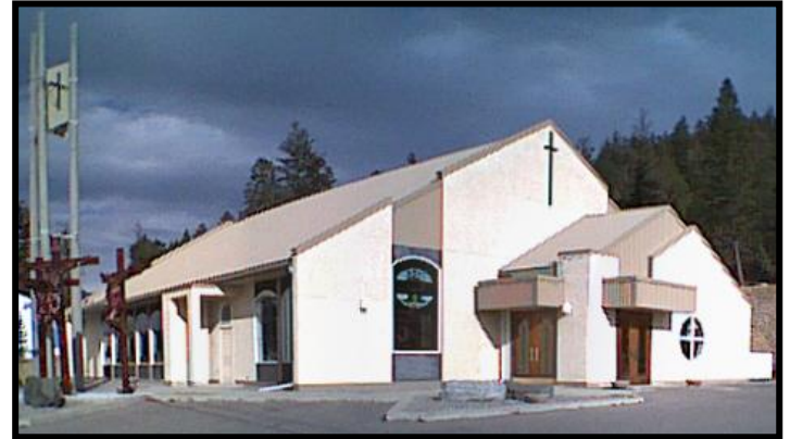
St. Joseph's Church (SJC) Hwy 93/95, Radium Hot Springs, BC